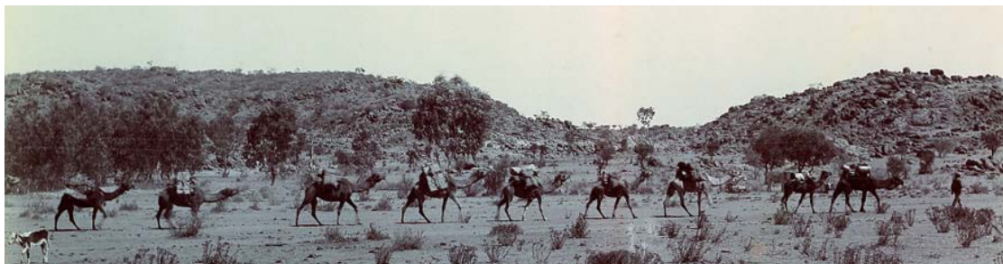
Camel train approaching Alice Springs telegraph station, 1890s

Inevitably, memories of the cameleers have faded. In recent decades events such as the 'Camel Cup' races have evoked the 'Afghans' as colourful, but marginal figures. Today, despite the efforts of historians, too little is known of the cameleers' place in Australia's heritage and their key role in our past.