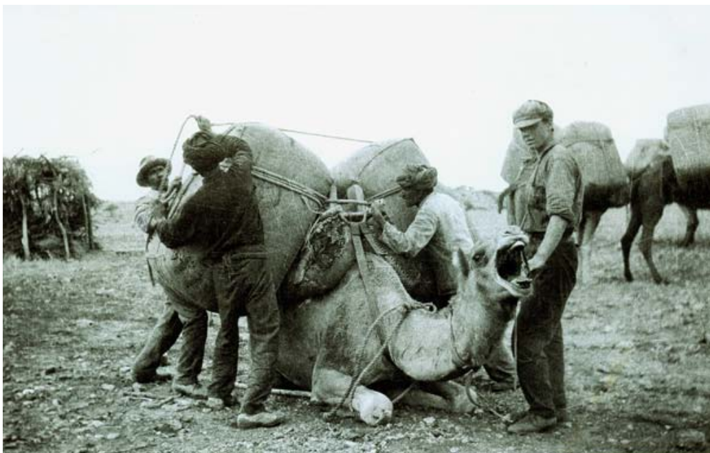
Loading camels at Marree, ca. 1901

Telephone 03 99272754 from 8.30am – 5.00pm Monday to Friday.