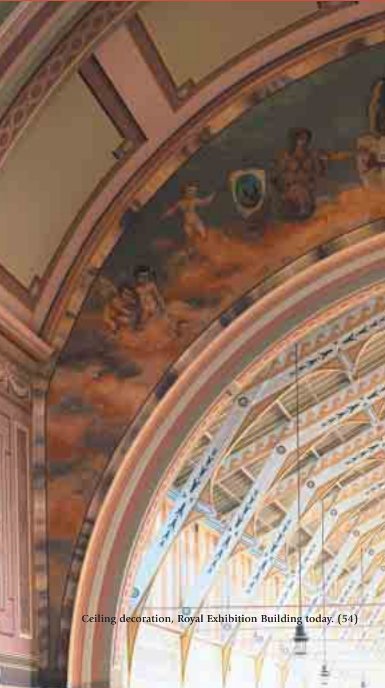
Ceiling decoration, Royal Exhibition Building today. (54)