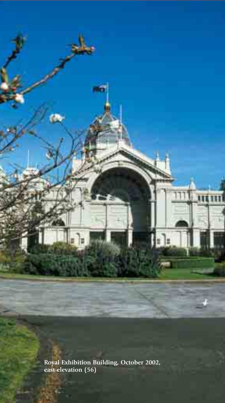
Royal Exhibition Building, October 2002, east elevation (56)