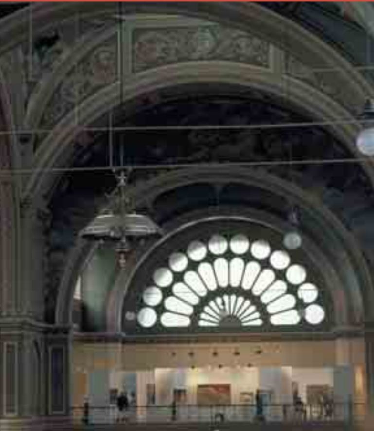
Art Fair, October 2002. (55)